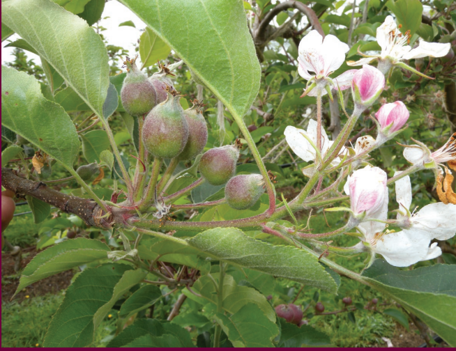
FIGURE 1: Late flowering