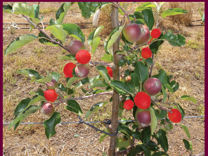
FIGURE 3: Red fruit to be removed by thinning