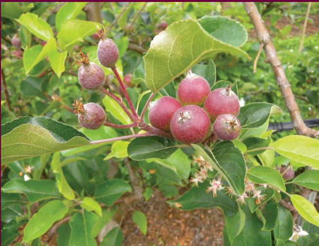
FIGURE 2: Late fruit set